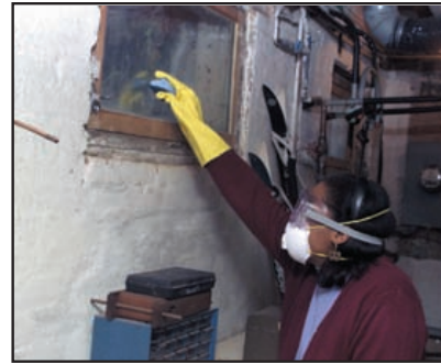
Cleaning while wearing N-95 respirator, gloves, and goggles.

■ Wear goggles. Goggles that do not have ventilation holes are recommended. Avoid getting mold or mold spores in your eyes.