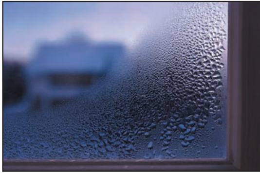
Condensation on the inside of a window-pane.